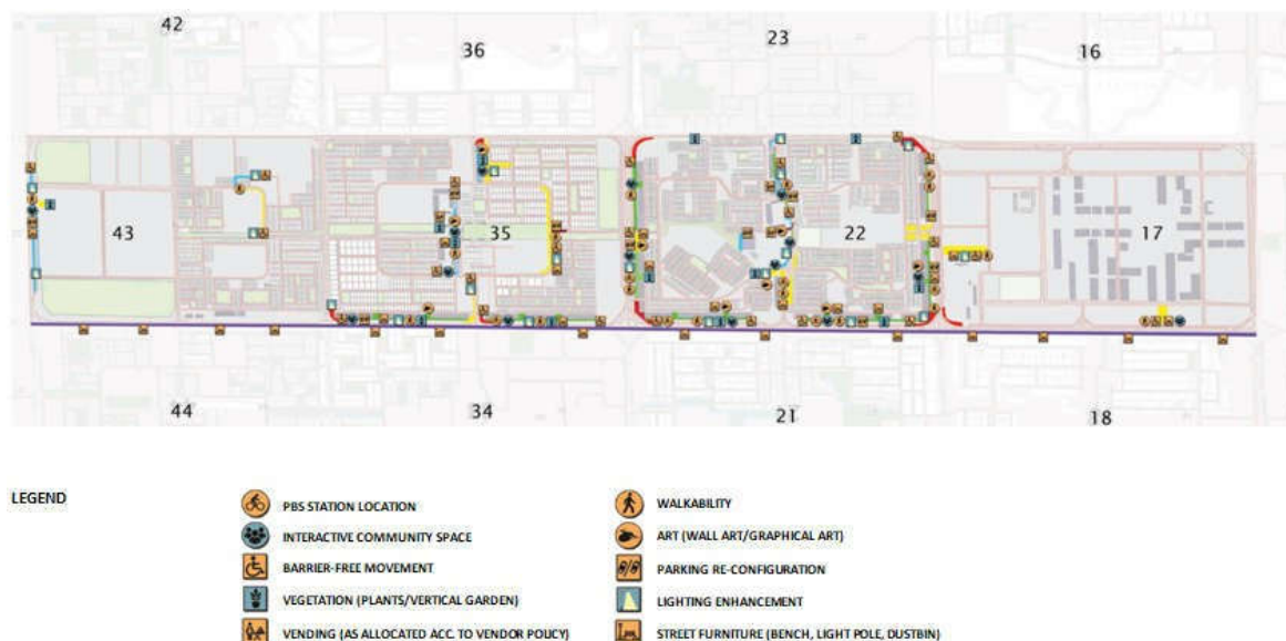
Figure 4. Existing pockets with holistic locations of proposed components throughout the study area

The figure 4 below gives a clear picture of the holistic locations of the components.