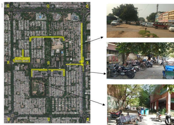
Figure 3. Identified pockets for Placemaking in Sector 35