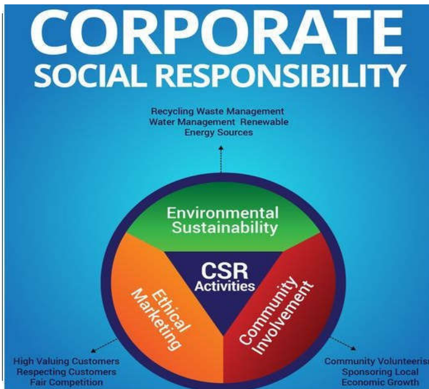
FACTORS OF THE CSR

foreign direct investment (FDI). A company's attention to social responsibility is critical in order to ensure that businesses are held accountable to all shareholders as well as to its workers, customers, suppliers, and other stakeholders. Business sectors are encouraged to help build a country while also investing in their own workers and the local community's well-being via CSR initiatives [5].