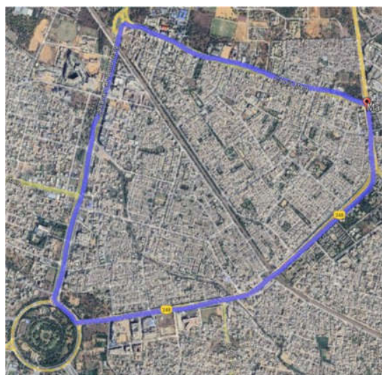
Figure 1: Google Imagery for Malviya Nagar, Jaipur.

Jaipur is amongst few of the first planned cities of Modern India. The southern region of the city has neighbourhood named Malviya Nagar after the freedom fighter Madan Mohan Malviya. Currently, it’s one of the poshest and most upmarket locations in Jaipur city. Its house to numerous government housing scheme while also caters to large number of private developers too. It has amenities as schools, universities, hospitals, Techno hub, restaurants, malls, showrooms and many other attractions. The neighbourhood is well connected with all the prime locations of the city, while the airport also being just 5-10 minutes away. The total area for Malviya Nagar is 3.284 sqkm (Source: Jaipur Development Authority) housing a population of 29033 persons (Source: Census Report 2011)