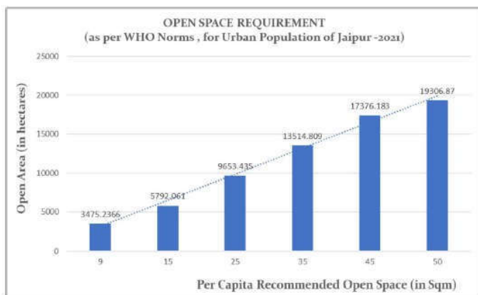
Figure 2: Open Space required for the population of 2011

In the present research work, Malviya Nagar has been taken as a case study area for critical analysis with respect to open area requirement for the projected population 2011-2051. As has been reflected in the fig.no.2 & presented in fig no.3 it would reveal the fact that with the present population, & the available open area, the per person open area comes to 22.62sqm while it predicted to go below the bare minimum of 9 sqm by the year 2034 with the present growth trend & developmental activities. Let further be observed that in the year 2034 it may reach to a level of 8.26 sqm which appears to be highly critical & pose multi-dimensional & diversified problems.