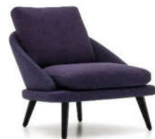
Fig: Lawson Arm Chair